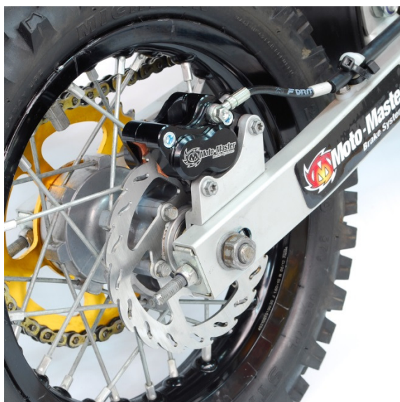
Caliper mounted on 2013 SX50